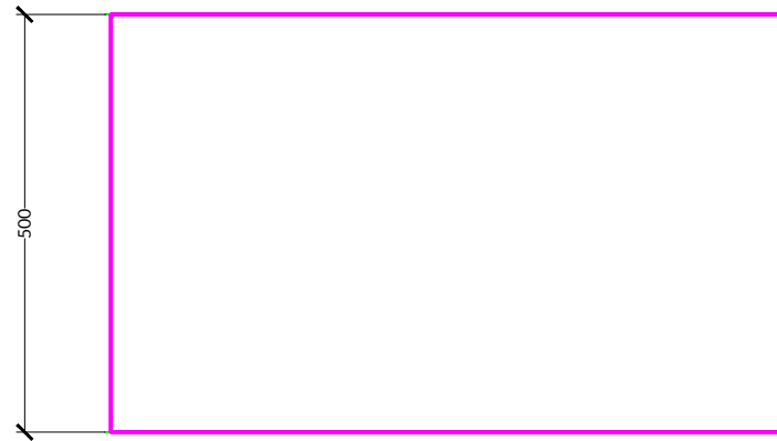
PLAN - SCALE 1:50 - A3